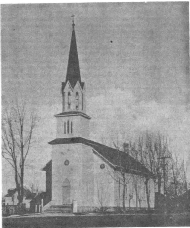
St. Ansgar's Lutheran Church, 1873-1970. The building was bought by the Baptist church in 1973.